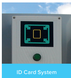
ID Card System