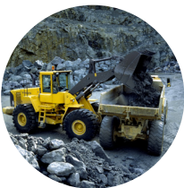
Construction and Mining