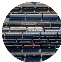
Transport and Logistics