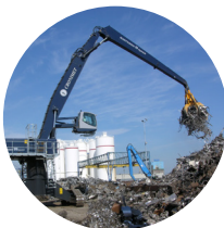
Waste and Recycling