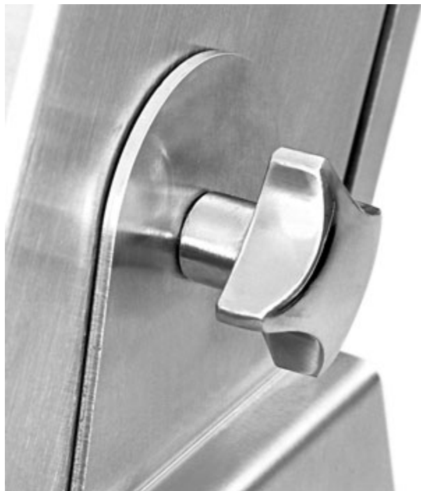
STAINLESS steel inclination adjustment system