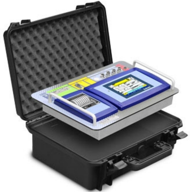
3590ETKR - 4 platform display example (AF08 software)